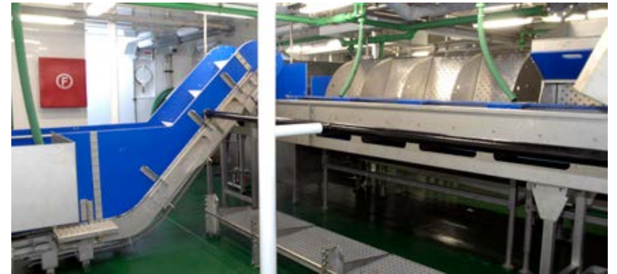
Gutting and sorting station with conveyor from stern hoppers.

For navigation the ship is fitted with the latest model radars, GPS navigators and AIS from Furuno. The main radar, FAR 1518 is fully type approved. It can be controlled with a conventional control panel or with a standard trackball for ease of use. It comes with groundbreaking