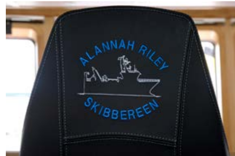
Customised Skippers Seat.