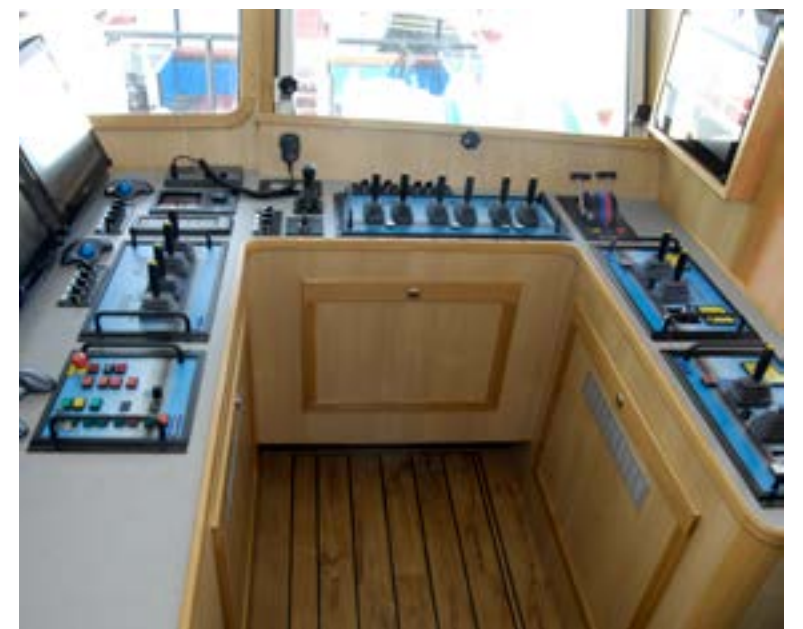
Trawl control station

For deck and ship safety, Barry Electronics have installed the most sophisticated CCTV seen on an Irish fishing boat. Using IP technology the system has 14 cameras and any or all cameras can be displayed on any of five