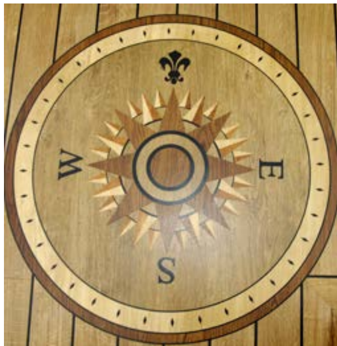
Wheelhouse Floor Compass Rose.