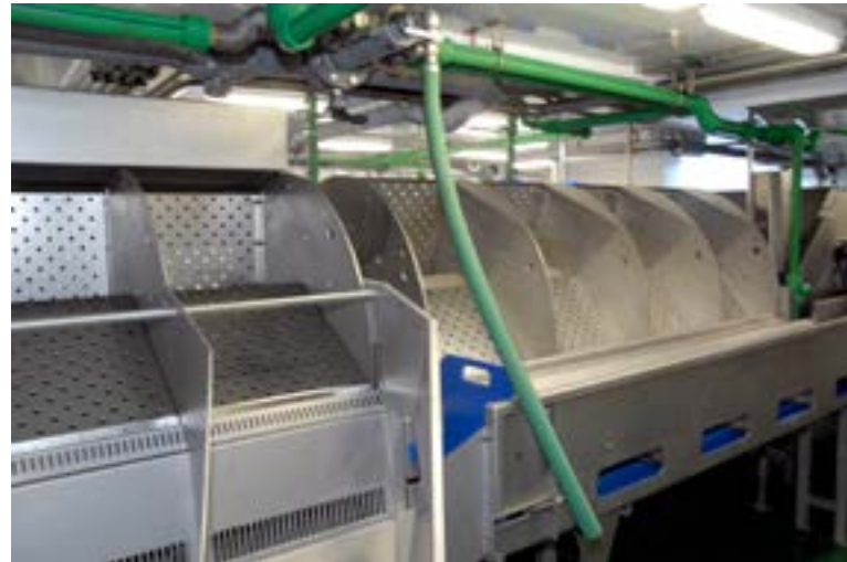
VCU fish washing system.

The dipping machine is equipped with a 9-compartment drum each with a capacity of 63 litres. This drum rotates and ensures that each section with langoustines stays in the preservative bath for 8- to 15 minutes depending on the setting. The 4-compartment washing machine can also be used for processing fish.