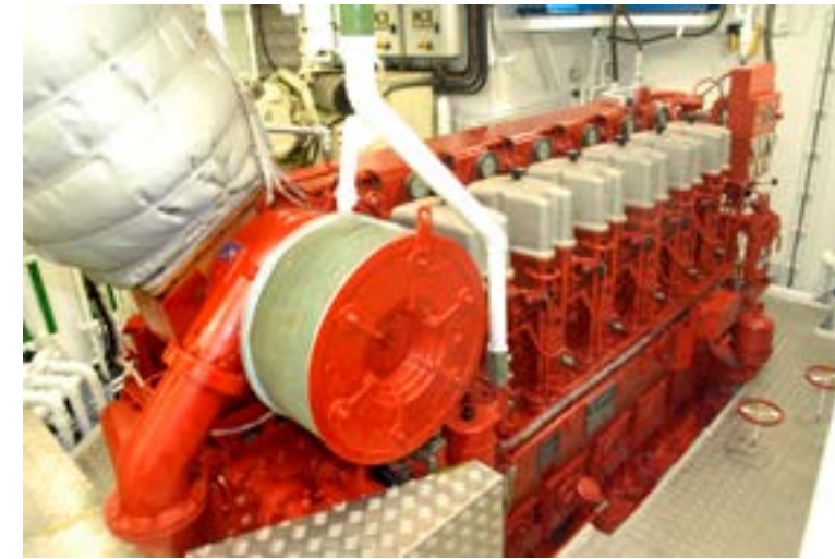
ABC Main engine.

PHONE: 027 71300 / 60130 • FAX: 027 71310 • MOBILE: 087 2395498 • E: harbourengineering@eircom.net VAT NO: IE 6348552K