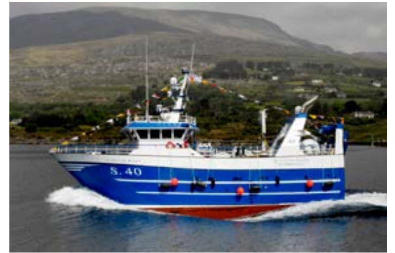
Steaming up Berehaven Sound.