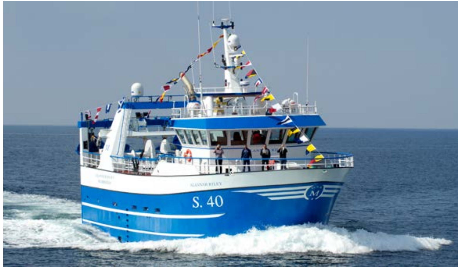
Alannah Riley arriving into Bantry Bay

A large crowd of West Cork fishermen gathered in Castletownbere mid May to welcome home the new 24mtr Prawn Freezer Trawler "Alannah Riley" to her home port for the first time.